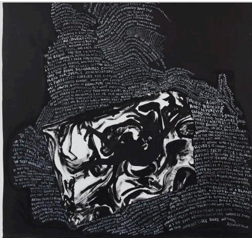
Kara Walker, Feast of Famine , 2021. Flashe, ink, and cut paper on paper. 139 ¾ x 133 ¾ inches.